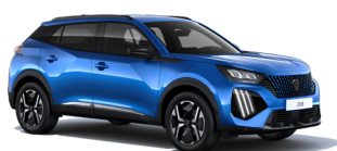
Vertigo Blue (M6SM) pearlescent $950