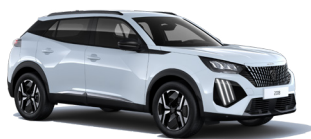
Okenite White (M0SU) metallic $550