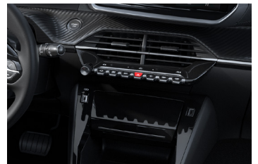
Piano Key Toggle Switches