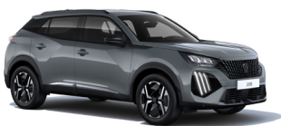
Selenium Grey (M0LD) metallic $0