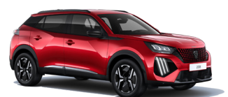
Elixir Red (M5VH) special $950