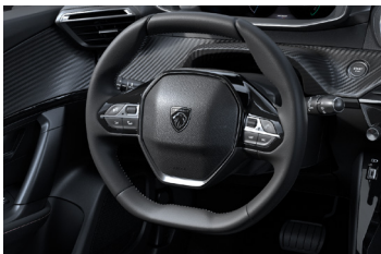
Compact multi-function steering wheel

The PEUGEOT i-Cockpit® philosophy centres around a driving environment that puts you in control, allowing a greater connection to the road. For PEUGEOT 2008, the PEUGEOT i-Cockpit® brings driving resolutely into a new age. The PEUGEOT i-Cockpit®, comprises of the following key features: