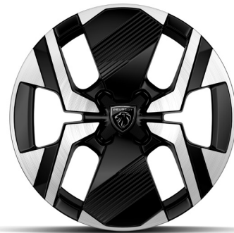
17" 'KARAKOY' Alloy Wheels (DZHL3) Diamond Cut