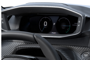
Heads Up Instrument Panel Display