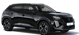
Nera Black (M09V) metallic $550