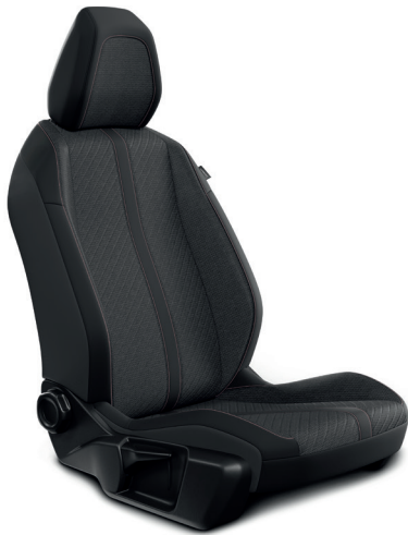
'Casual Lomsa' Seat Trim Standard