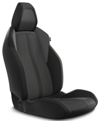
'Belomka' Seat Trim Standard