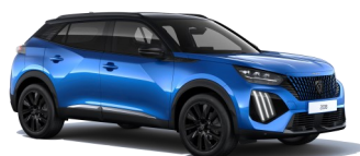
Vertigo Blue (M6SM) Pearlescent $950