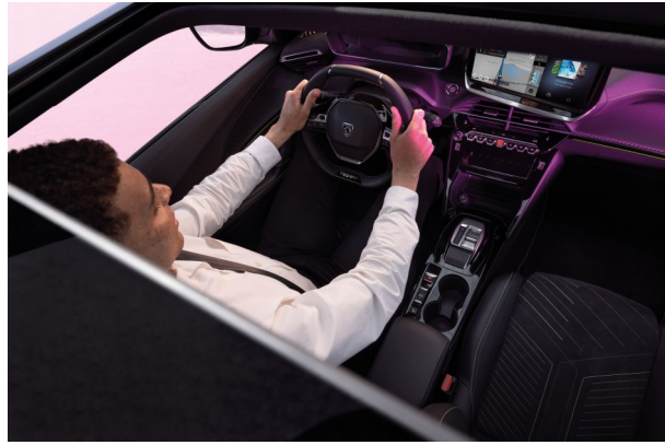
Opening Panoramic Sunroof with Interior Blind- (DTC07)