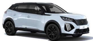
Okenite White (M0SU) Metallic $550