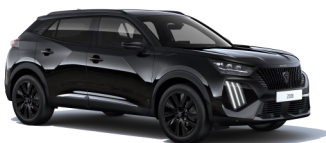
Nera Black (M09V) Metallic $550