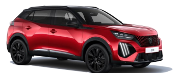
Elixir Red (M5VH) Special $950