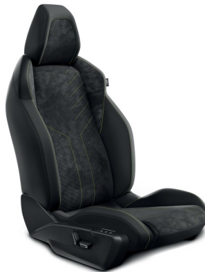
'Alcantara' Seat Trim Optional Upgrade $2,990