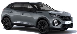
Selenium Grey (M0LD) Metallic $0