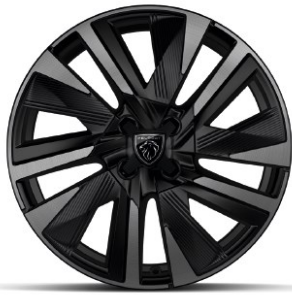
18" 'EVISSA' Alloy Wheels (DZHKQ)