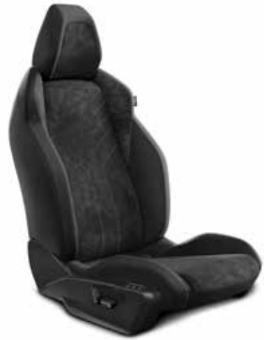
'Alcantara' Seat Trim Optional Upgrade $2,990