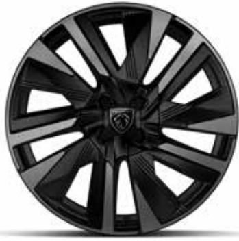
18" 'EVISSA' Alloy Wheels (ZHKP) Diamond Cut Black Mist