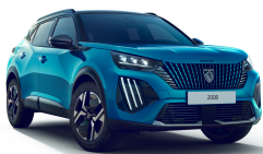
Obsession Blue (MODP) metallic $0