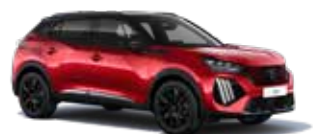
Elixir Red (M5VH) special $950