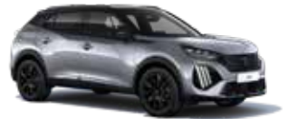
Cumulus Grey (M0F4) metallic $550