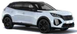
Okenite White (MOSU) metallic $550