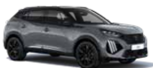
Selenium Grey (MOLD) metallic $950