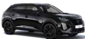
Nera Black (M09V) metallic $550