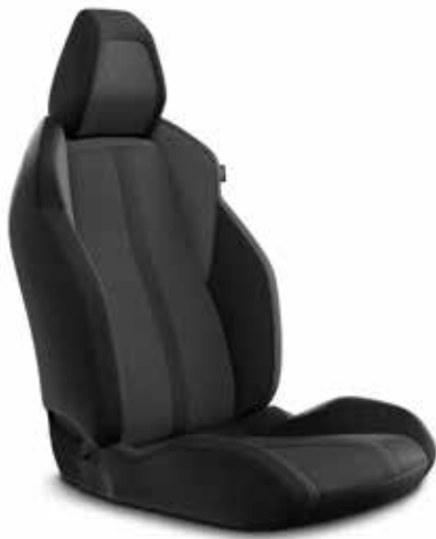
'Belomka' Seat Trim Standard