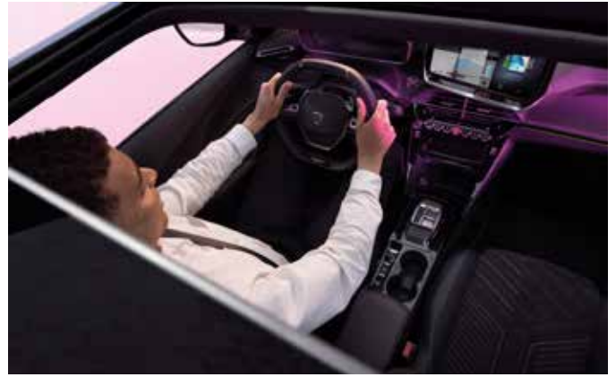
Opening Panoramic Sunroof with Interior Blind Optional Upgrade $2,990