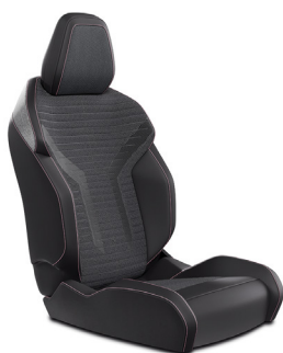
'Uziris' Fabric Seat Trim Standard