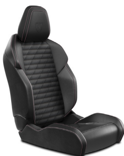
'Mistral' Nappa Leather Seat Trim Optional Upgrade $5,990