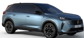
Ingaro Blue metallic $0