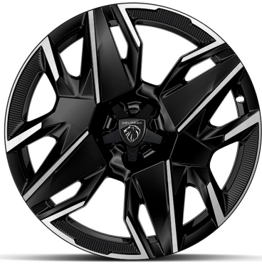
19" 'YARI' Alloy Wheels Black Diamond