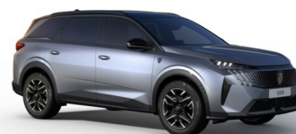
Cumulus Grey metallic $750