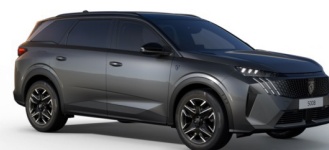
Titane Grey metallic $750