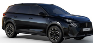
Nera Black metallic $750