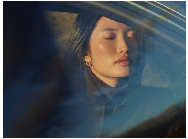
Large opening panoramic sunroof with electric retractable interior blind & Clean Cabin — optimised cabin air quality management system (optional) $2,990