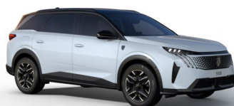
Okenite White metallic $750