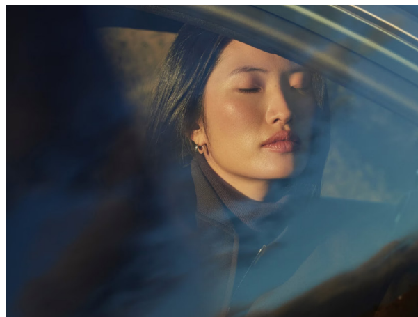
Large opening panoramic sunroof with electric retractable interior blind & Clean Cabin — optimised cabin air quality management system (optional) $2,990