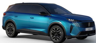
Obsession Blue metallic $0